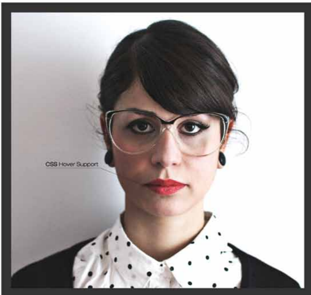
any normal browser